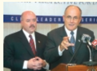
Former New York City Police Commissioner and Former Interior Minister for Iraq, Master Bernard Kerik, Regional Developer for New York City.